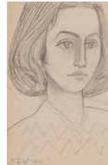
Self Portrait with Self Made Sweater , 1944 Françoise Gilot Pencil on paper, 21 x 13.5 cm