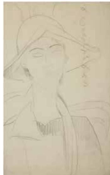
Portrait de Gabrielle, 1918 Amedeo Modigliani Graphite on paper; 43.3 x 26.7 cm