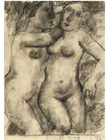
Les Deux Amies (Two Friends) , 1930 Paul Delvaux Pencil, brown & black wax crayon on paper, 36 x 26.5 cm