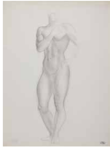
Nu académique (Academic Nude) , n.d. André Derain Pencil on paper 62.6 x 48 cm