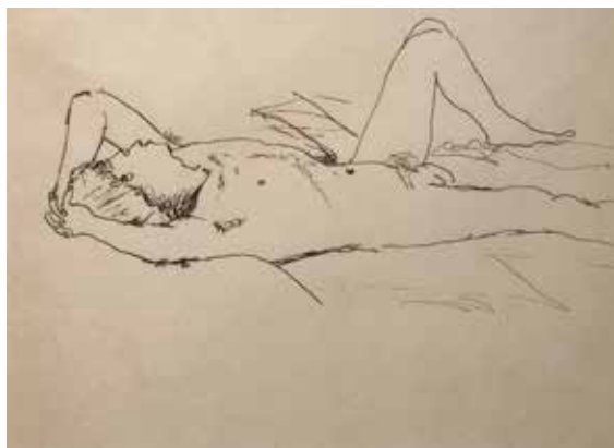
Portrait of Bill, (Willem de Kooning) 1950 Elaine de Kooning Ink on paper; 20.32 x 27.94 cm