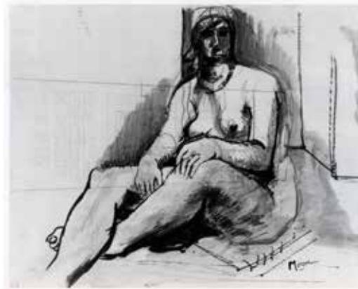
Seated Woman no.2 , 1930. Henry Moore Pencil, brush & ink, watercolour paper: 36.8 x 46.4 cm