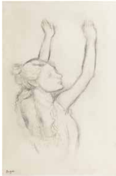
Danseuse, les bras levés (Dancer with Raised Arms) , n.d. Edgar Degas Charcoal on paper, 48.9 x 31.7 cm