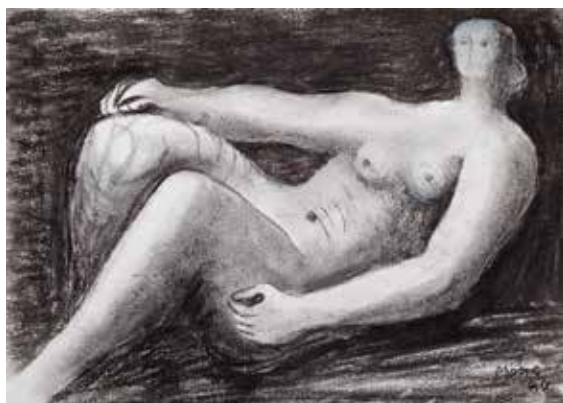
Reclining Nude , 1980 Henry Moore Charcoal & gouache on paper 25.3 x 35.4 cm