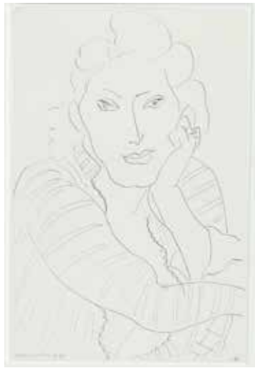
Buste de femme accoudée, (Bust of a woman resting on her elbow) 1940 Henri Matisse Pen & ink on paper; 61 x 41 cm