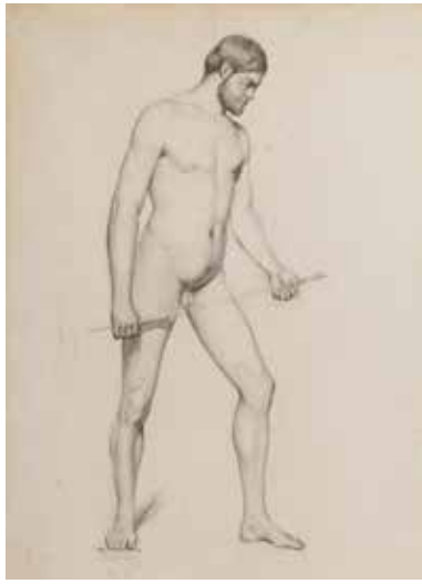
Académie d'homme (Academic Drawing of a Man) , 1862 Paul Cézanne Charcoal on paper, 61 x 47 cm