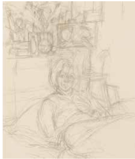
Jeune femme allongée, (Young Women Laying Down) 1954 Alberto Giacometti Pencil on paper; 49.7 x 32.1 cm