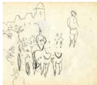
Carnet Bataille de fleurs, Nice, basse Seine, Nogent (Drawing book dedicated to the flower parade in Nice, basse Seine, Nogent) n.d. Raoul Dufy Pencil on paper

Like many artists, Dufy would carry around a pocket-size sketchbook, in which he could make visual 'notes' of the scenes, atmosphere & details that he would later paint once back in his studio... in this particular sketchbook, the artist captured the festive spirit of the "Lou Mai" carnival in Nice.