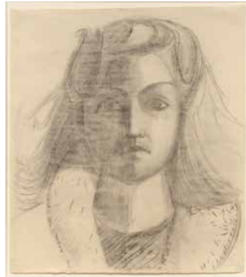
Portrait de Jeune Fille, (Portrait of a young girl) 1944 Pablo Picasso Charcoal on paper, 55.5 x 48 cm