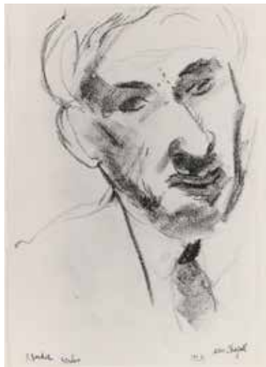
Portrait de Barchan, 1923 Marc Chagall Charcoal on paper; 27 x 19.2 cm