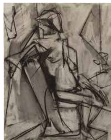
Untitled , 1940 Lee Krasner Charcoal on paper, 63.5 x 48.3 cm