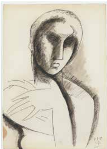
Jeune fille mélancolique, (Melancholic Young Girl) 1939 Julio González Ink & wash on paper; 37.1 x 26.7 cm