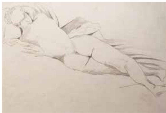
Portrait of Bill, (Willem de Kooning) 1950 Elaine de Kooning Ink on paper; 20.32 x 27.94 cm