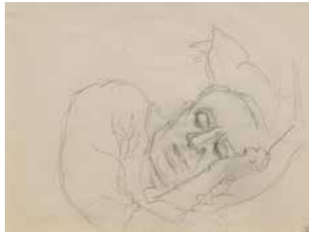
Picasso Dormant, (Picasso Sleeping) n.d. Dora Maar Pencil on paper, 19 x 24.5 cm