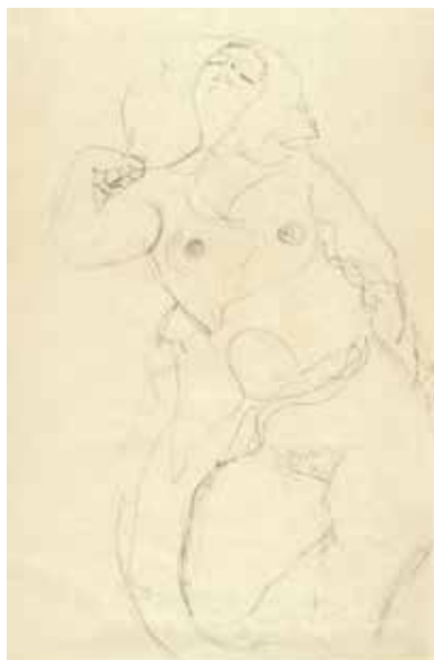
Nude With Right Hand on Shoulder , 1914-15 Gustav Klimt Pencil on Paper, 56.8 x 37 cm