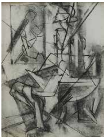
Seated Figure , 1937 Mercedes Matter (with corrections by Hans Hofmann) Charcoal on paper, 63.5 x 48.26 cm