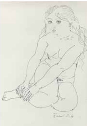
Nu assis (Seated Nude) , c. 1930, Raoul Dufy Indian ink on paper, 50 x 35 cm,