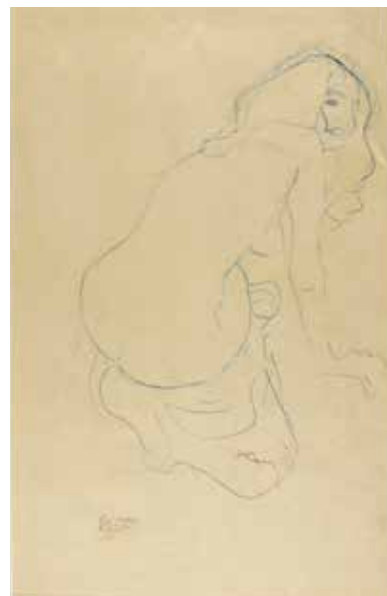
Nude to the right with long hair , 1910 - 11 Gustav Klimt Coloured pencil on paper, 55.2 x 35 cm