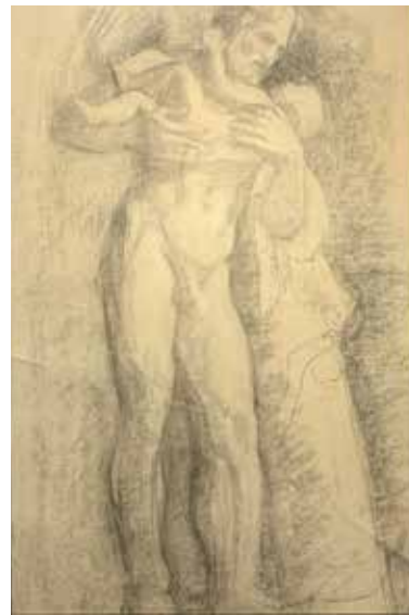
Untitled (Man & child) , c. 1936-38 Louise Bourgeois Charcoal on paper laid down on newspaper 61.3 x 44.5 cm