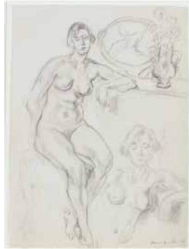
Etude de Nus (Study of Nudes) , 1920 Henri Matisse Pencil on paper, 38.4 x 28.3 cm