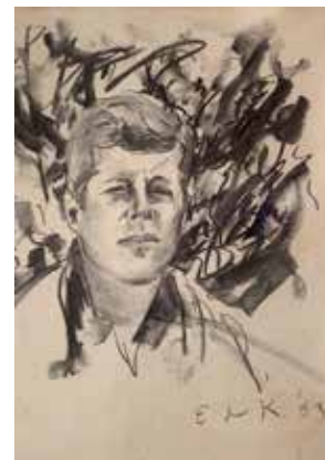
Portrait of JFK , 1963 Elaine de Kooning Charcoal on paper, 45.7 x 30.5 cm

Since 1860, Degas became infatuated with the dancers at the Opera de Paris, an inexhaustible source of inspiration & subject matter that he has drawn, painted, & sculpted throughout his entire career. Picasso's infatuation with women was an integral part of his life & work as an artist. Gilot succeeded Maar as muse & lover of the Spanish master & their infatuation for him is visible in both artists' work.