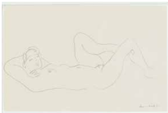
Nu Couché (Reclining Nude) , 1927 Henri Matisse Pencil on paper; 32.9 x 50.7 cm