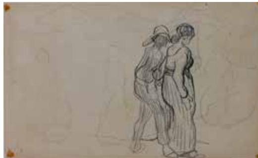
Couple Walking and Still Life: recto/verso , 1890 Vincent Van Gogh Pencil on paper, 44.5 x 27.4 cm

Often, an artist will make various studies on one sheet of paper, starting & stopping, exploring new angles, new subjects... giving an insight into their thought process, what they see as they begin to put pencil to paper. In this example Van Gogh has rotated & flipped the paper covering every available space with figures & still-lives.