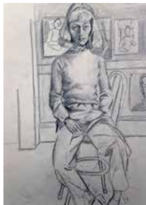
Self Portrait , c. 1946 Elaine de Kooning Pencil on paper, 27.31 x 21.59 cm