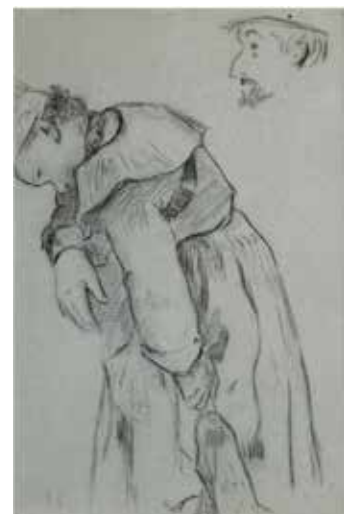
Bretonne de trois-quarts à gauche, (Breton Woman, three-quarters to the left) n.d. Paul Gauguin Charcoal on paper; 46 x 31 cm