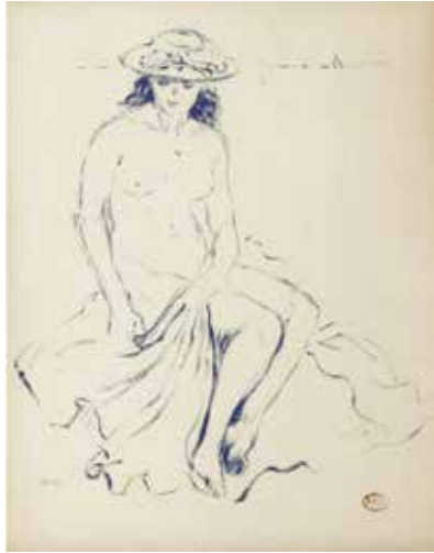
La baigneuse (The Bather) , n.d. Henri-Edmond Cross Pastel & ink on paper, 30.5 x 23.5 cm