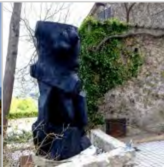
Steph Cop – Aro Etude 8.0