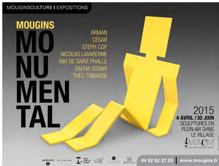
Mougins Monumental 2015 poster

Mougins Monumental, the open-air exhibition of sculptures