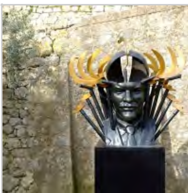
Arman – Communo Cephalite