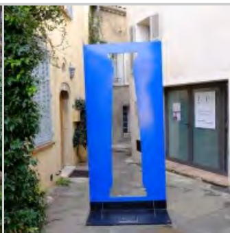
Sacha Sosno – Colonne Bleue