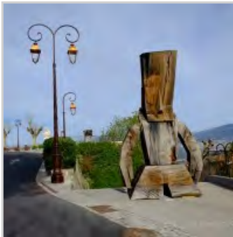
Steph Cop – Aro 5.0