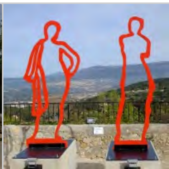
Sacha Sosno – Vénus Rouge Tribute to Venus & Arman