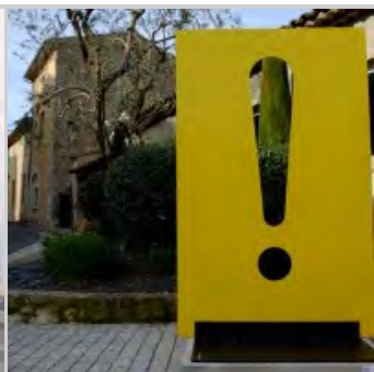
Sacha Sosno – Exclamation