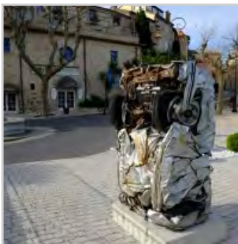
César – Porsche compression