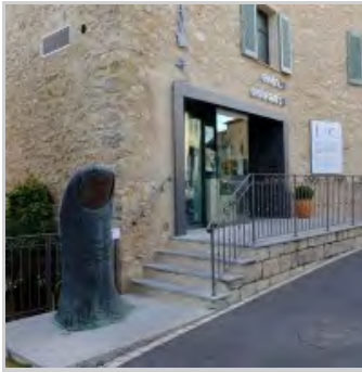
César – Le Pouce