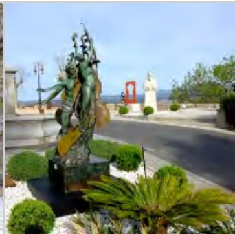
Arman – A Marienbad (Diace & Acteon)