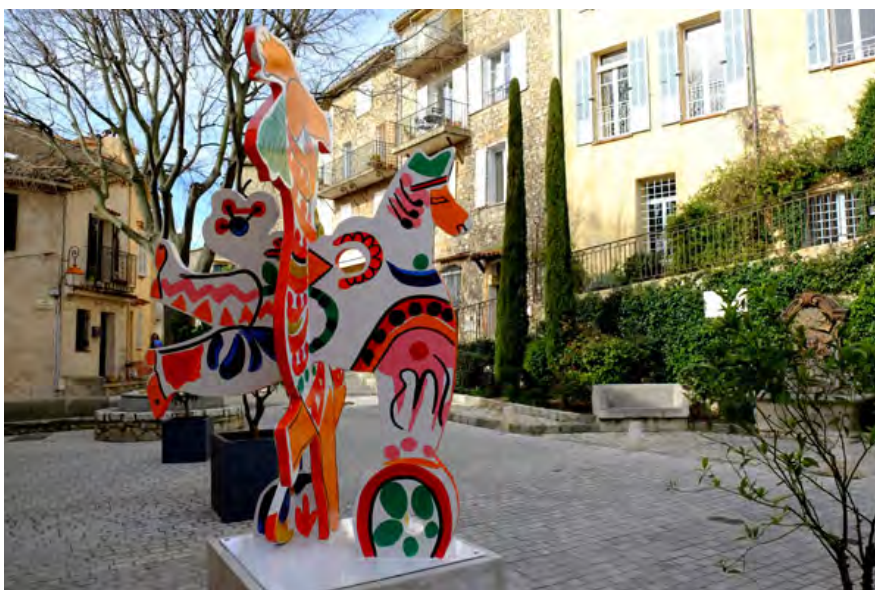
Théo Tobiasse – Les Saltimbanques

From April 4, 2015, Mougins Monumental, a pleasant Art promenade through the steeped in history village, invites you to travel through time, and will let you better understand the evolution of the artistic world of the 60s. From the Nouveaux Réalistes movement to the contemporary succession, you will discover a fascinating world of Art through this decor of monumental sculptures.