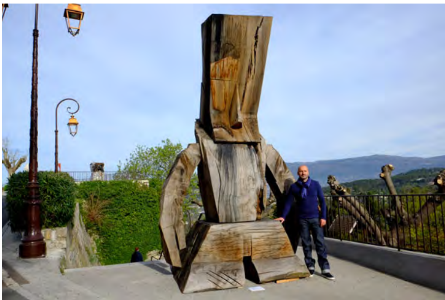
Monumental Steph Cop